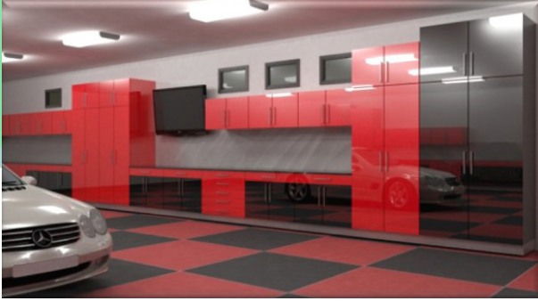
Organizer Shown Extended